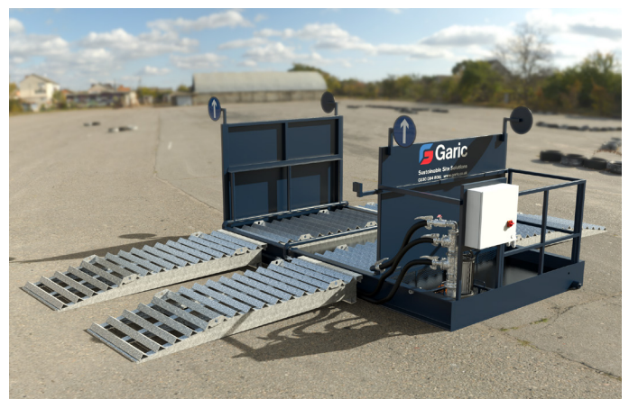
Previously named City Wheel Wash