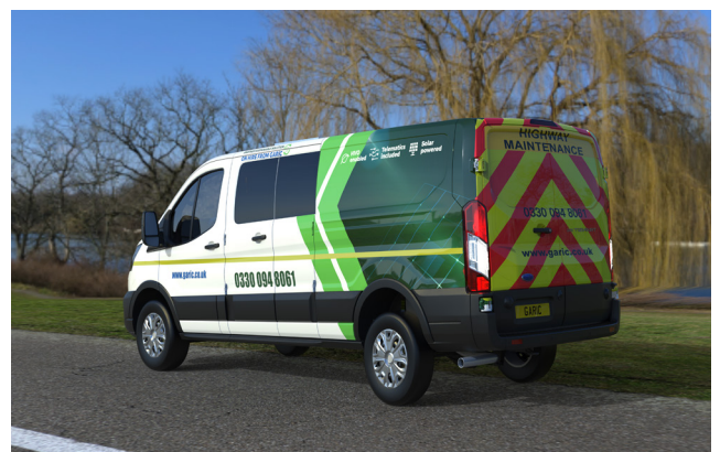
Previously named Hybrid Welfare Van 2.0